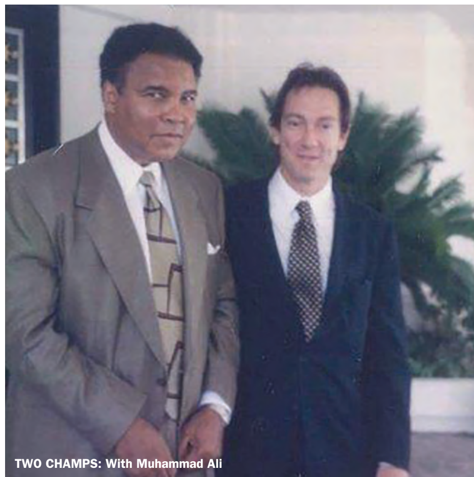
TWO CHAMPS: With Muhammad Ali

way endorses a belief in the occult.” The “Thriller” video, directed by John Landis and clocking in at 14 minutes, was the first world premiere on MTV and is easily the most influential pop-music video in history. It is the only music video the Library of Congress has ever selected for its National Film Registry.