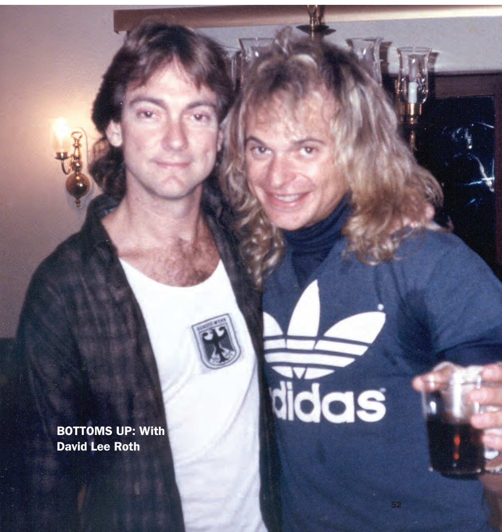
BOTTOMS UP: With David Lee Roth

you had told me I could represent Brian Wilson, or Michael Jackson, I would have said, how much do I have to pay to do that? To even meet one of those people would have been enough."