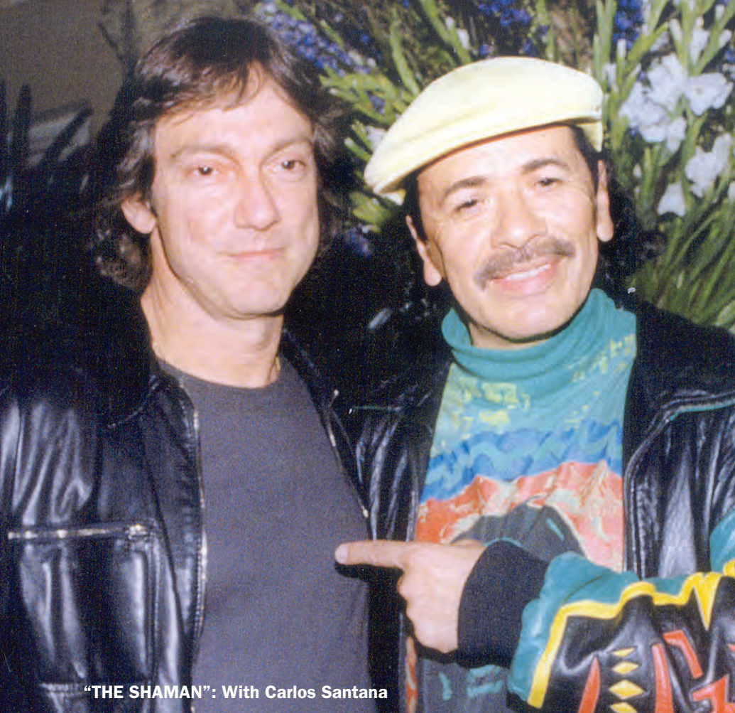
"THE SHAMAN": With Carlos Santana