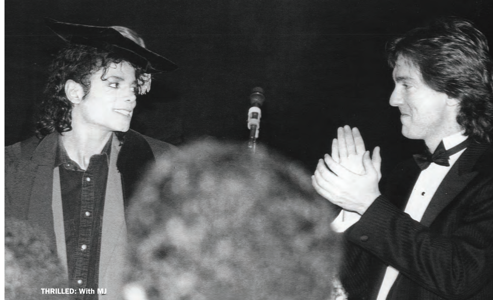
THRILLED: With MJ